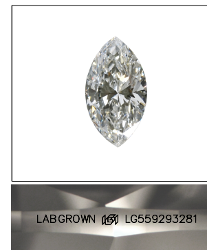
LASERSCRIBE SM Sample Image Used