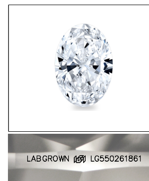
LASERSCRIBE SM Sample Image Used

November 4, 2022 IGI Report Number LG550261861 Description LABORATORY GROWN DIAMOND Shape and Cutting Style OVAL BRILLIANT Measurements 12.91 X 8.83 X 5.62 MM GRADING RESULTS Carat Weight 4.01 CARATS Color Grade H Clarity Grade VS 2 Cut Grade VERY GOOD